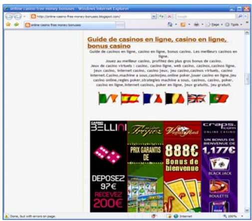
Fig.3 A sample splog on BlogSpot

Trackback is a method for notifying author (e.g.: blog author) when somebody has linked to one of their posted documents [8]. This notification is usually in the form of comment at the end of original blog post which has link back to cited document. Trackback is misused by spammers place a link to their campaigns from legitimate domains.