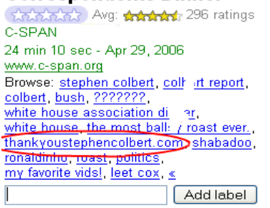
Fig.8 A sample tag spam.

In the next section we propose our evaluation framework