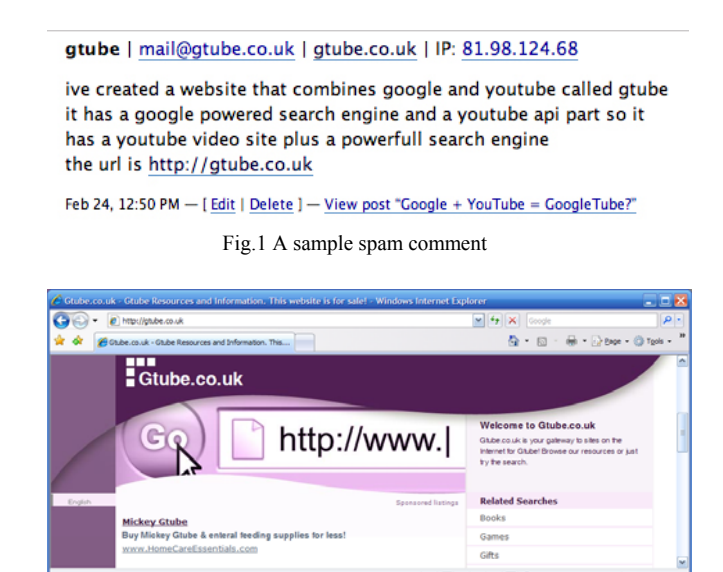
Fig.2 A sample linkfarm page

In this paper, we focus on evaluating current anti-spam methods for preventing and detecting spam content in blog, online forums, wikis, tags and online communities and we referred to as Web 2.0 anti-spam methods. We classify each anti-spam methods based on in its application and evaluate them along specific criteria. The perspectives presented here is to show to the best of our knowledge how much work has been done in each the spam domain and to highlight which domains require further investigation.